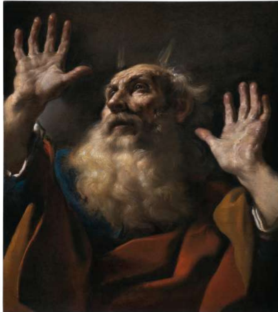
Giovanni Francesco Barbieri, called Il Guercino Moses , Oil on canvas, 72 x 63 cm

Moretti Fine Art, a renowned Old Master Paintings and Sculpture dealership founded by Fabrizio Moretti, will open its new Paris gallery on 14 September with an exhibition of the rediscovered masterpiece Moses by Italian Baroque Master Giovanni Francesco Barbieri (1591–1666), known as Guercino.